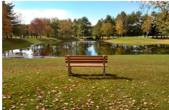
Park bench at Elm Avenue Park

In a public park for all to enjoy for years to come!