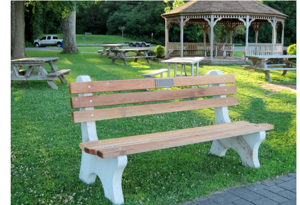
Park bench along the river at Henry Hudson Park

In accordance with Town specifications, park benches are 6 feet long with concrete sides and wooden slats.