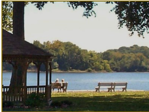
Park benches along the river at Henry Hudson Park

In a public park for all to enjoy for years to come!