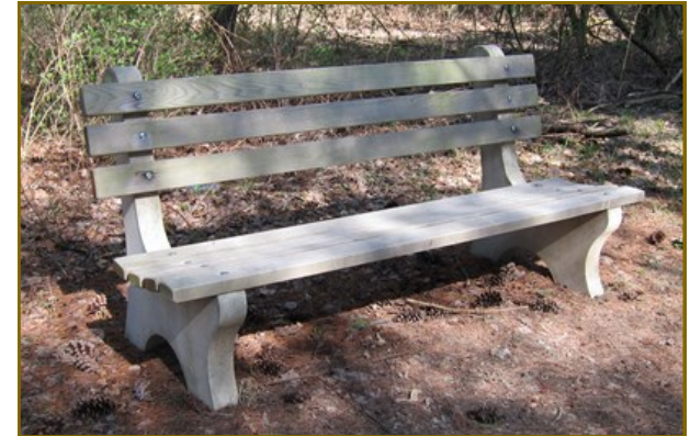
Park bench (without plaque) on the Fitness Trail at Elm Avenue Park

In accordance with Town specifications, park benches are 6 feet long with concrete sides and wooden slats.